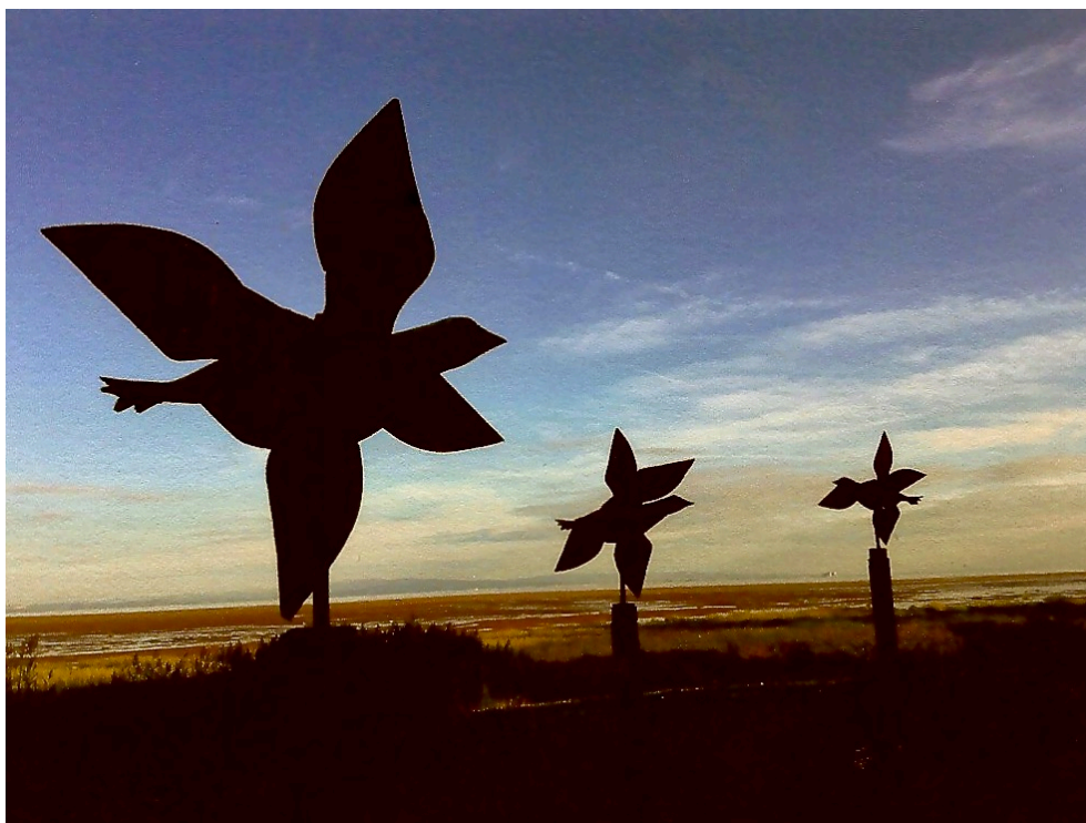
Whirligig flock of corncrakes

This rag, tag and bobtail carnival of unruly artists taking their alternative ideas to streets, parks and village halls might not seem much like community art. And sometimes, it wasn't. In the pioneer years, no one quite knew what community art was, though some thought they knew what it ought to be. It was enough to follow intuition and desire, to try things out and discover what worked. But Welfare State's spirit was always in community art because they were open to everyone and interested in what they could contribute. Many of those who gravitated to Welfare State were not artists when they came, though they might be when they left, whether they stayed years or just a few hours. Still, settling down in Ulverston changed everything again.