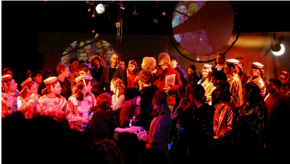
Longline Opera Finale, 2006

performance creates its own sense, subverting rationality and connecting to deeper, elemental things. But you must trust your experience.