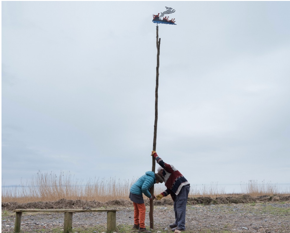
White Hare spindle vane