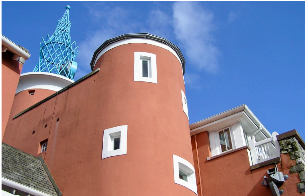
The Lanternhouse in 2006