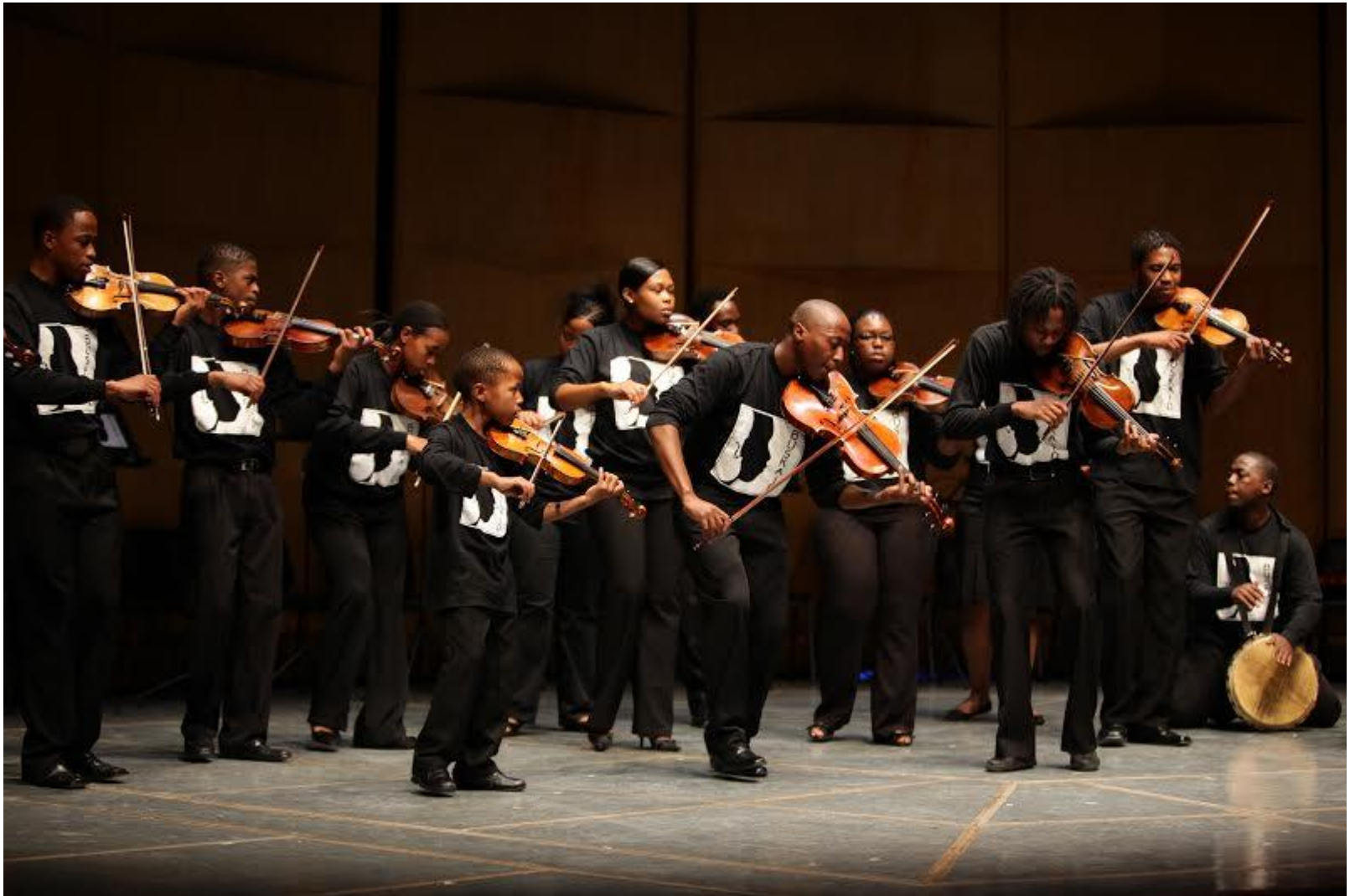
Buskaid Soweto String Ensemble